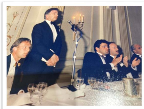
Chairman of the Anglo American Sporting Club

By the late 1990s I was doing more music shows, particularly in The Gulf. The first was at the Marina and Yacht Club in Abu Dhabi and since then I have promoted regularly in Bahrain, Dubai, Qatar and memorably at the Hard Rock Café in Beirut. Visiting Beirut shortly after the Hostage Crisis was a strange experience. Would I be next? As it happened I enjoyed my visit very much and could see why Beirut had been the playground for the French. The past 45 years have been a challenge, with the inevitable disappointments, but I have been lucky enough to see the world, while working on headline sport and music events and meeting a