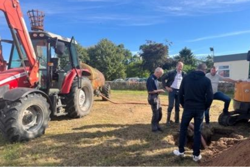
Excavation and percolation testing at one of several locations to determine drainage parameters